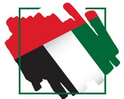
U E A