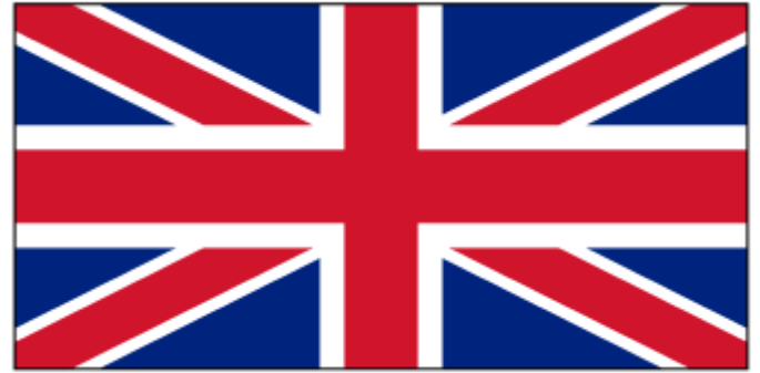
The United Kingdom